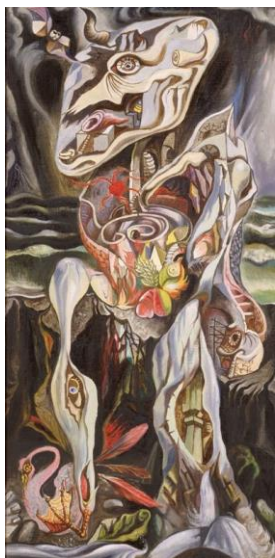
Figure 2: André Masson, Labyrinth , 1938.

Additionally, in order to collect ontology requirements, an online survey will be distributed among specialists in Outsider Art at different institutions across the world, e.g. Museu d'Art Brut 1 (Barcelona), Collection de l'Art Brut 2 (Switzerland), Outsider Art Fair 3 (Paris), Raw Vision Magazine 4 , etc.