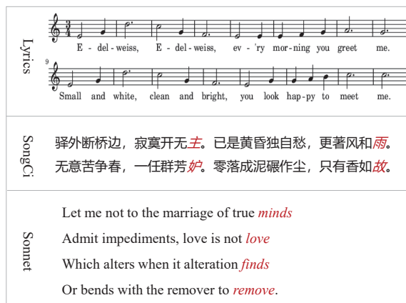
Figure 1: Examples of text with rigid formats. In lyrics, the syllables of the lyric words must align with the tones of the notation. In SongCi and Sonnet, there are strict rhyming schemes and the rhyming words are labeled in red color and italic font.

2014; Gehring et al., 2017), Transformer and its variants (Vaswani et al., 2017; Dai et al., 2019), pre-trained auto-regressive language models such as XLNet (Yang et al., 2019) and GPT2 (Radford et al., 2019), etc. Performance has been improved significantly in lots of tasks such as machine translation (Bahdanau et al., 2014; Vaswani et al., 2017), dialogue systems (Vinyals and Le, 2015; Shang et al., 2015; Li, 2020), text summarization (Rush et al., 2015; Li et al., 2017; See et al., 2017), story telling (Fan et al., 2018; See et al., 2019), poetry writing (Zhang and Lapata, 2014; Lau et al., 2018; Liao et al., 2019), etc.