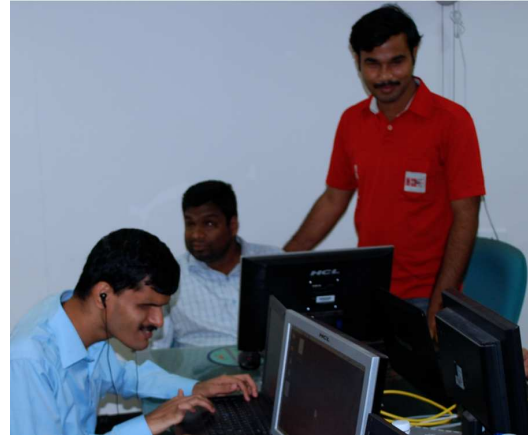
Figure 4: Active discussion among Visually Challenged candidates, during a training session