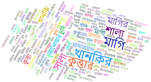
Figure 1: Traditional Swear Word Cloud