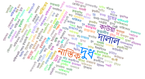
Figure 2: Non Traditional Swear Word Cloud