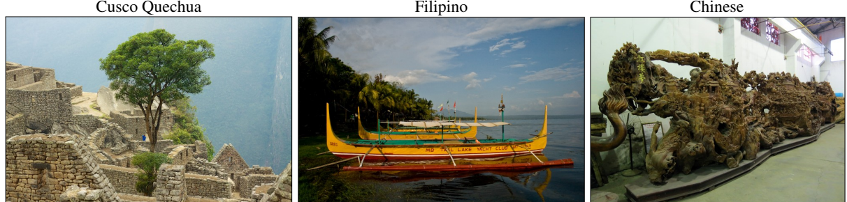
Source: Shanghai Wangjia [ ... ] by Stefan Krasowski Figure 2: A sample of images in the XM3600 dataset, together with the language for which they have been selected. Overall, the images span regions over 36 different languages and 6 different continents.

Telugu English Swahili Source: Lens louse / Linslus by Henrik Palm Source: APN59H 101010 CPS by Chris Sampson dan thookka m 02 by rojypala Cusco Quechua Filipino Chinese