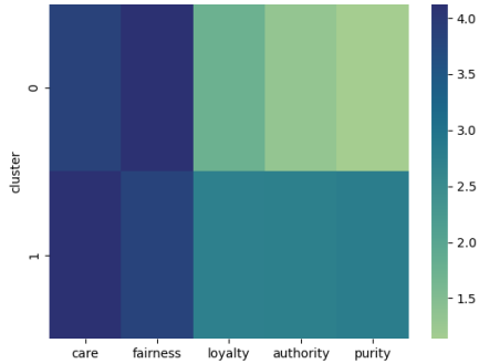
Figure 1: Heatmap of the mean scores for the five foundations across clusters.

(Caliński and Harabasz, 1974) and Davies Bouldin Index (Davies and Bouldin, 1979). We obtained 2 clusters, cluster_0 (CL_0) with 41 annotators, and cluster_1 (CL_1) with 16.