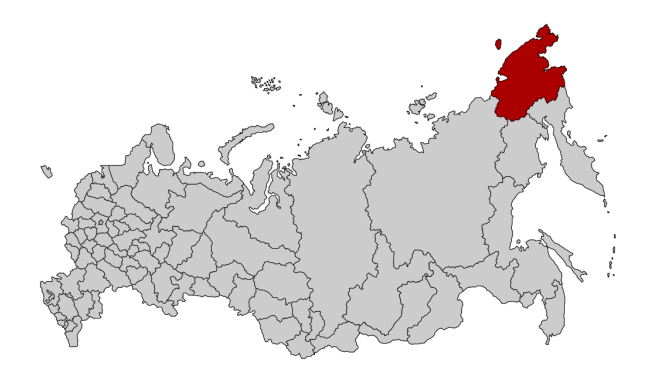
Figure 1: Location of Chukchi-speaking area within the Russian Federation

similar spoken dialects and a written standard variety, which has been codified in a Soviet-era reference grammar, (Skorik, 1977) and differs from colloquial varities in a number of ways. The work described in this article is largely based on Dunn (1999). Dunn's grammar is written mostly for the Telqep dialect, which is spoken in the Tawajwaam village close to Anadyr, the administrative centre of Chukotka.