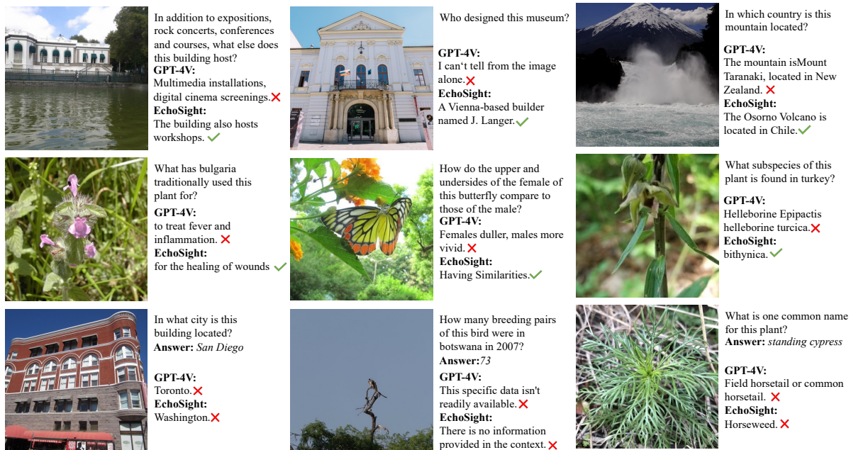
Figure 3: Qualitative VQA results from Encyclopedic VQA comparing to GPT-4V. The first row shows results in landmarks and the second row in natural species. Some failure cases are shown in the third row altogether with ground-truth.