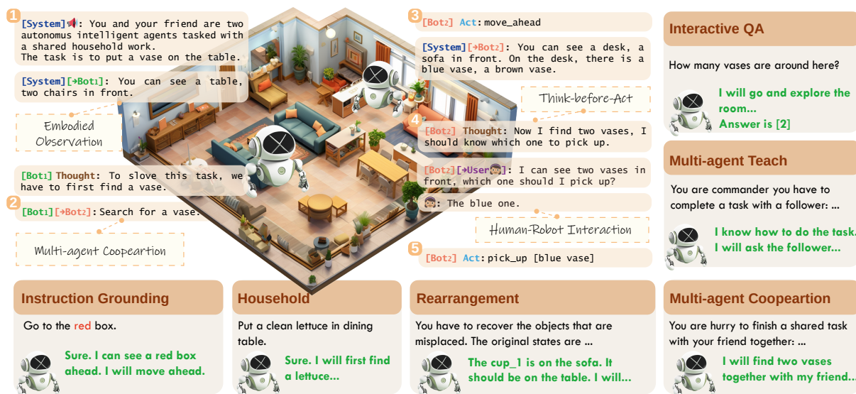
Figure 1: Task illustration of LangSuit-E. Top-Left: a typical example of a cooperative task between two agents. The agents are entirely blind ( i.e. , without visual perception) and can only obtain embodied information from the system. Around: Exemplar tasks supported by LangSuit-E.

ied scene perception and language models for low-level control. However, these works can only be applied to constrained environments and require large volumes of data for pre-training.