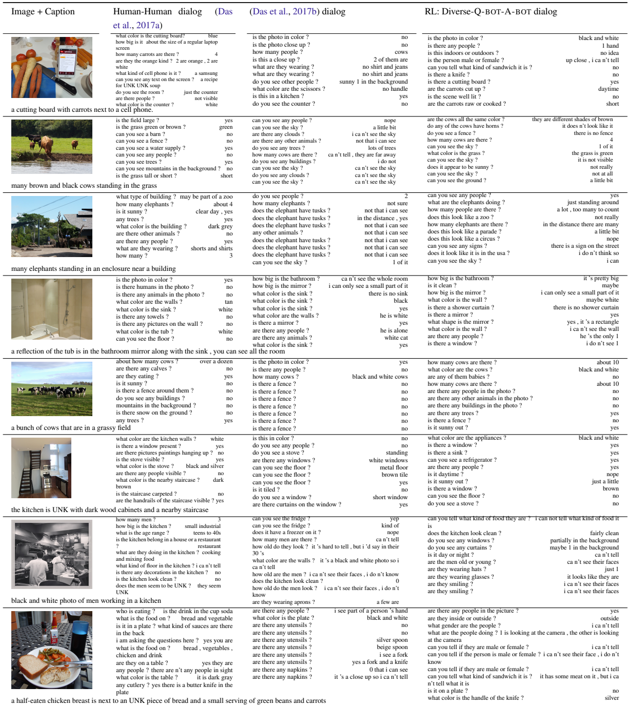
Table 4: Selected examples of dialog on v1.0 VisDial test split for different RL variants. We observe that variant involving Diverse-Q-BOT generates more diverse, image relevant and fluent dialog.