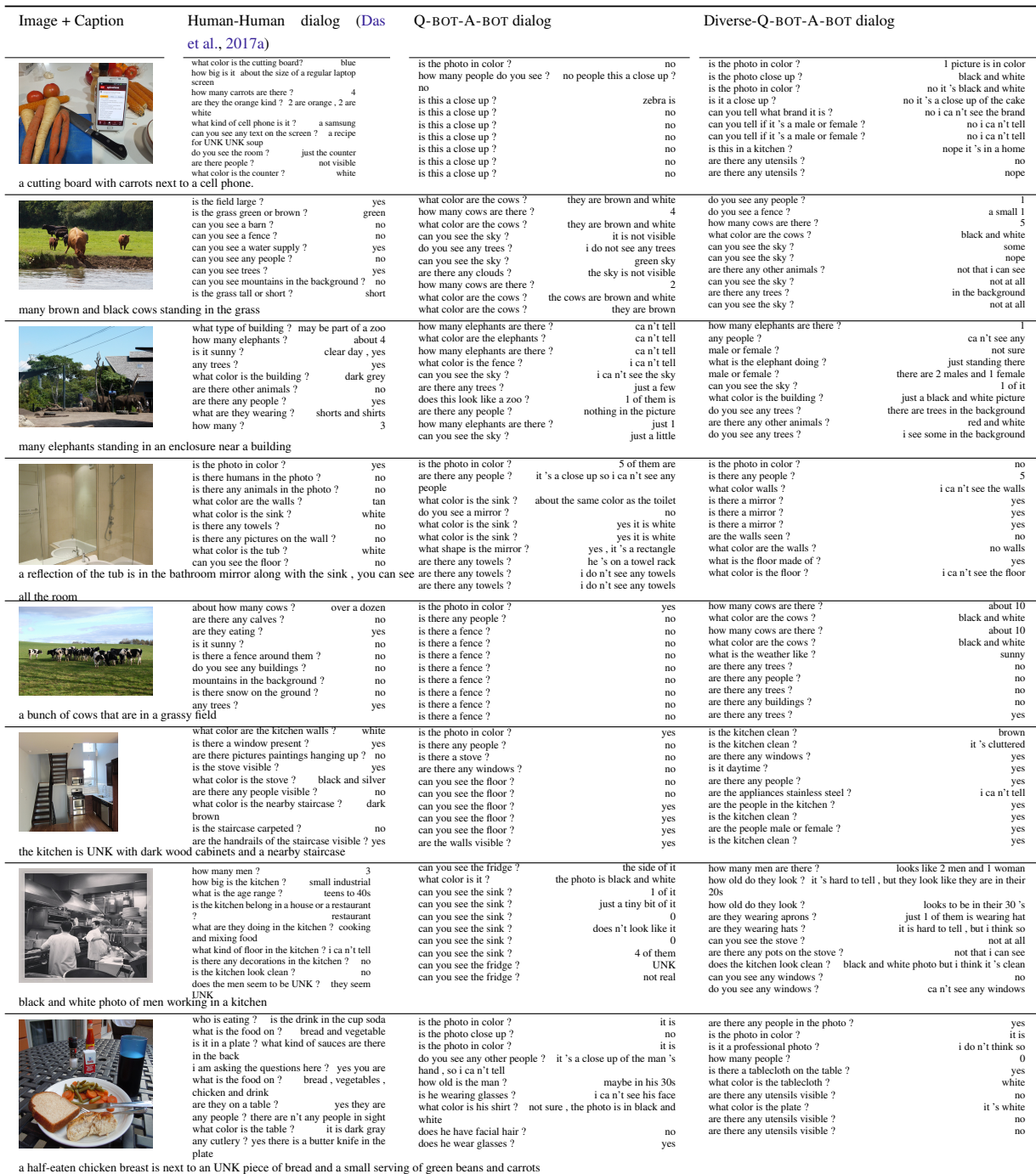
Table 3: Selected examples of dialog on v1.0 VisDial test split for different SL variants. We observe that variant involving Diverse-Q-BOT generates more diverse, image relevant and fluent dialog.