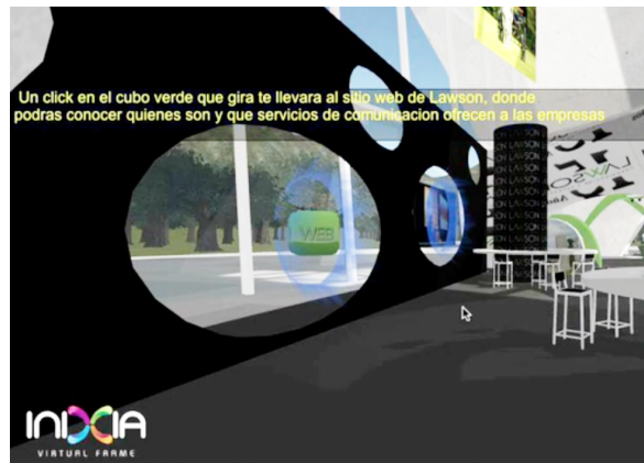
Figure 3: The virtual guide took the visitor to an interactive object and encourages him/her to manipulate it

Our annotation process was simpler and more straightforward than (Benotti and Denis, 2011a), where artificial intelligence planning is used to normalize reactions, mainly due to the fact that users can not change the virtual fair state during their visit, they can only change their own posi-