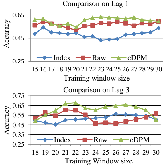
Figure 4: Comparison of prediction accuracy of up/down stock index on S&P 100 index for different training window sizes.

ket than others. Our proposed sentiment time series using cDPM can capture this phenomenon and also help reduce backchannel noise of raw sentiments.