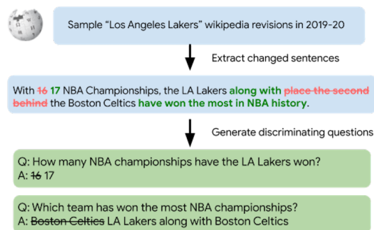
Figure 1: DIFFQG consists of paired Wikipedia passages that correspond to factual edits. The goal is to generate a discriminating question given an answer span such that the question is answerable by one of the passages but not the other or yields different answers.

exposed the limited transfer between logical entailment and general factual change detection (Thorne et al., 2018a) as well as the need for interpretable models for this task (Kumar and Talukdar, 2020).