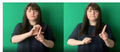
(a) RAPE (onset) (b) RAPE (offset)