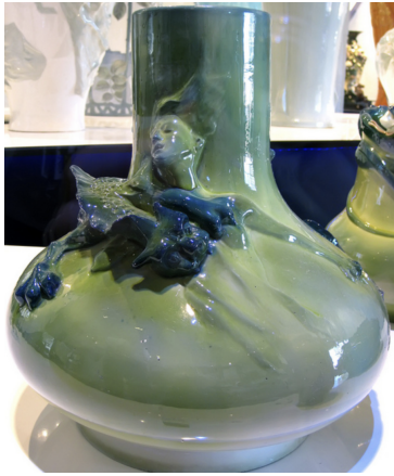
COCO Image 498100

Nucleus Sampling: The image displays a room filled with numerous decorative items. A prominent green ceramic vase stands out, with a colorful art deco sculpture depicting a woman laying on it. There are also two smaller vases in the scene – one in the upper right corner and the other closer to the center of the room. The room is adorned with a variety of objects, including a clock on the wall, a collection of books scattered in the background, and a chair positioned in the middle. This visually rich space showcases a diverse assortment of vases, sculptures, and other home decor items.