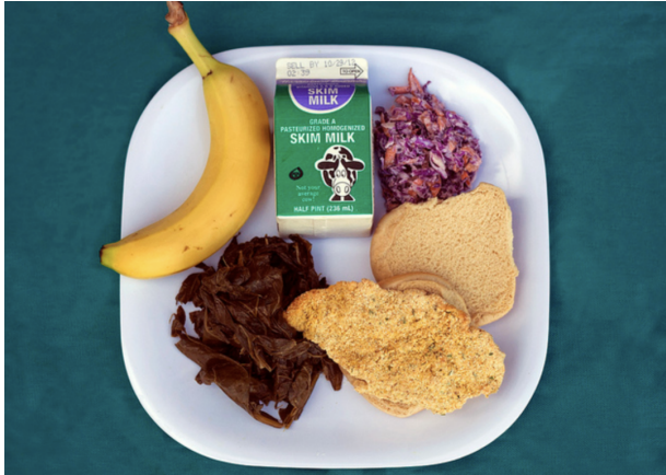
COCO Image 379404

Nucleus Sampling: The image displays a delicious meal consisting of chicken, broccoli, and a banana. The plate is large and fills most of the frame, with various items on the plate. The chicken is located at the bottom-right side of the plate, while the broccoli pieces are scattered throughout the plate. Additionally, there is a banana on the plate that is placed towards the top left corner. In the background, a bottle can be seen, likely containing a drink that complements the meal.