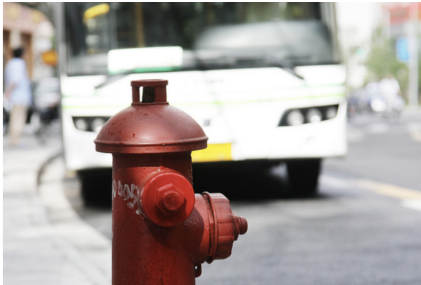
COCO Image 125524

LCD: The image features a white plate topped with various foods. On the plate, there's a banana positioned towards the left, accompanied by some meat, likely fish sticks. Alongside the main items, a glass of skim milk is present, adding to the nutritious meal. There is also a sandwich, possibly a piece of bread, contributing to the diverse meal displayed on the plate.