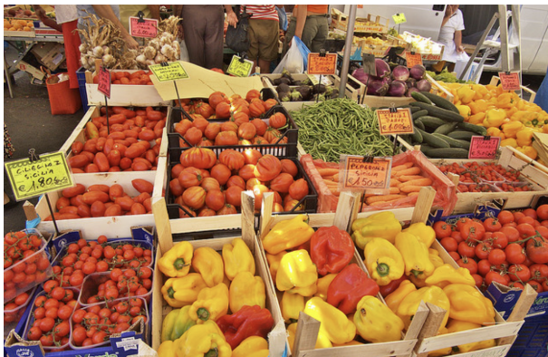
COCO Image 378873

LCD: The image showcases a kitchen setting featuring a microwave sitting on top of a shelf. Below the microwave, a toaster oven is placed in close proximity. There are also a couple of toaster ovens situated further back in the scene. A note is posted on the shelf, offering suggestions to keep everyone safe by covering one's experience while using the appliances, cleaning up after themselves, and not turning on the microwaves with no one around. The scene reflects a cooperative environment for kitchen users.