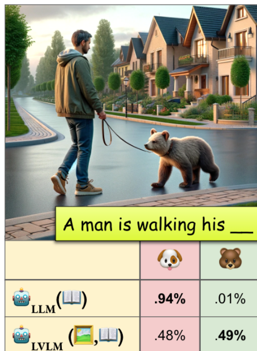
Figure 1: An illustration of LLM vs. LVLM token probabilities given an image and a text prefix mid-generation. According to the LLM, the word "dog" is much more likely to appear next. LCD dynamically contrasts these probabilities to mitigate language biases in LVLM outputs.

While hallucination-mitigation techniques in LLMs are actively researched, specific strategies for LVLMs are less developed. Current methods involve model-specific adjustments, additional training, or auxiliary models for post-hoc correction, and are often proven inefficient, costly, or limited by training data and model biases (Wang et al., 2023; Zhou et al., 2023; Gunjal et al., 2023; Yin