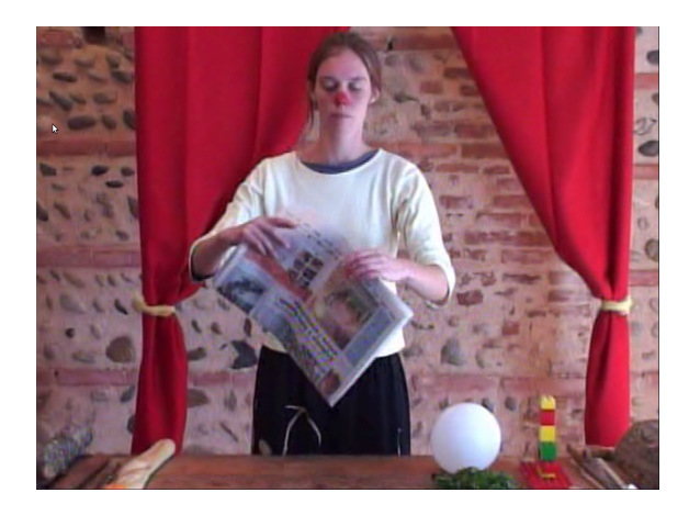
Figure 2: Action movie

more details on the experiment. As reported in details in (Desalle et al., 2010), the results confirm that 2-4 years old children produce more approximations than adults. According to the hypothesis, these differences between young children and adults should be retrieved by the study of the lexical organization of verbs.