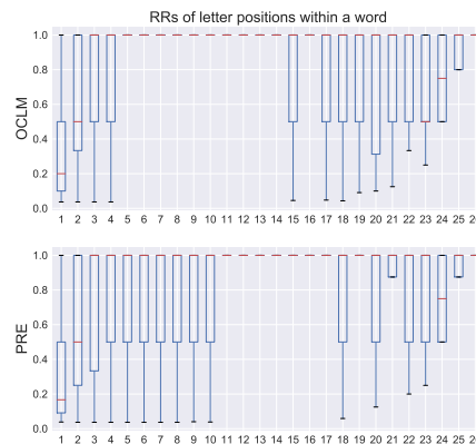
Figure 3: Reciprocal Ranks of letter positions within words ( n=1 )

their approaches are. In order to explore more deeply, we attempted to examine the internal behavior within each word in the test set. In Figure 3 the Reciprocal Ranks (RR), are presented for each letter position within a word. The OCLM algorithm demonstrates has higher RR (than PreLM) earlier in the word (position 5 vs. position 11) which is maintained for a longer period of time (10 positions in a row vs 7). Arguably, it is desired that the algorithm would predict correctly as early as possible, as its impact is on greater number of words (there are more words with 5 letters than with 10) and, a longer duration of high RR contributes to more accurate predictions as well. An analogous analysis of perplexity found a similar pattern of lower perplexity at earlier positions, together with similar duration, and a similar performance profile in OCLM vs PreLM.