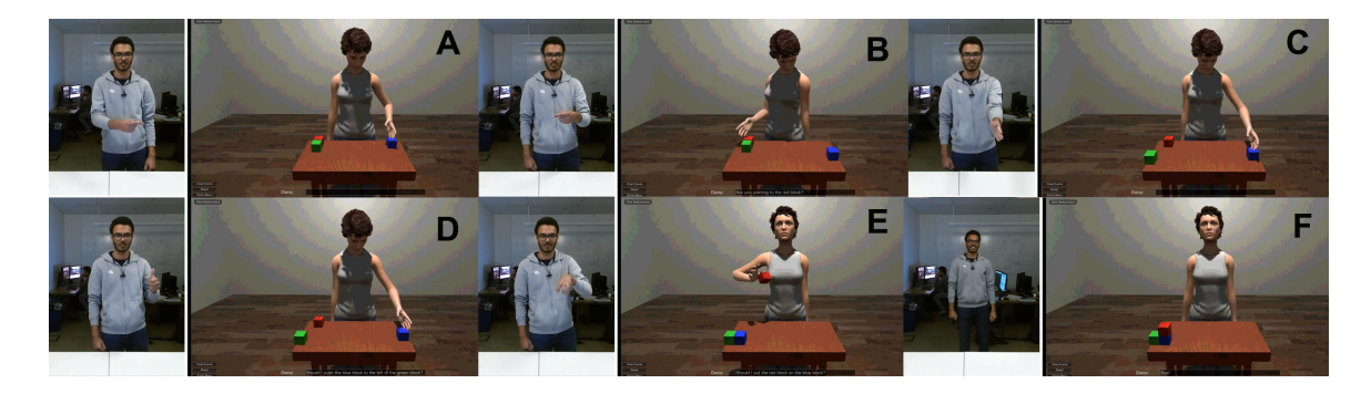
Figure 3: An example of building a staircase in HAB

go on the blue block, the green block, or the table top? The avatar asks and resolves these questions, and Frame F shows the completed staircase.