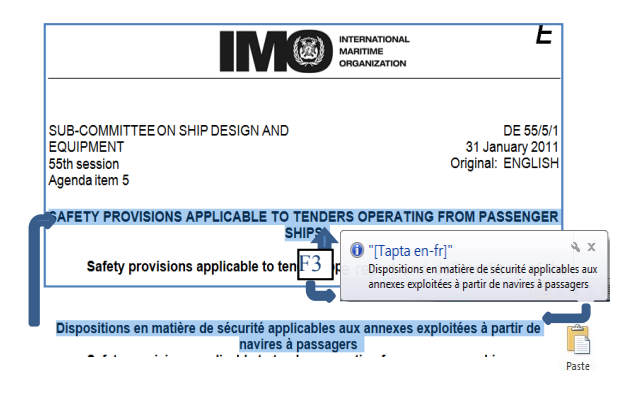
Figure 1: Translating with the "auto hotkey"

A web interface allows users to submit short texts and access the corresponding automatic