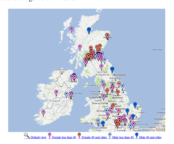
Figure 2: UK-wide speech database.

One of the key elements of the voice-banking project is the creation of a catalogue of healthy voices with a wide variety of accents and voice identities. This voice catalogue is used to create the average voice models for the speaker adaptation and to select the voice donors for the voice reconstruction. So far we have recorded about 500 healthy voice donors with various accents (Scottish, Irish, Other UK). This database is already the largest UK speech research database. An illustration of the geographical distribution of the speakers' birthplaces is shown on Figure 2. Each speaker has been recorded in a semi-anechoic chamber for about one hour using at each time a different script in order to get the best phonetic coverage on average. The database of healthy voices is first used to create the average voice models used for speaker adaptation. Ideally, the average voice model should be close to the vocal identity of the patient and it has been shown that gender and regional accent are the most influent factors in speaker similarity perception [14]. Therefore, the speakers are clustered according to their gender and their regional accent in order to train specific average voice models. A minimum of 10 speakers is required in order to get robust average voice models.