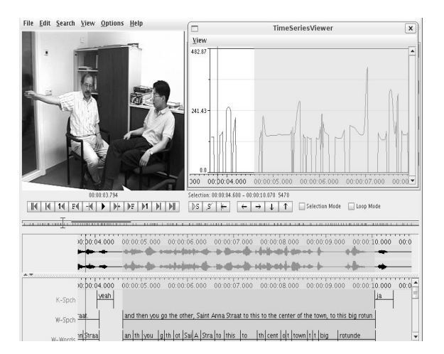
Figure 2: Screenshot of the annotation client interface, with video, time-aligned textual annotations, and time series displays.

time-aligned intervals with, typically, text content; the system leverages Unicode to provide multilingual support. Time series such as pitch tracks or motion capture data can be displayed synchronously. The user may interactively add, edit, and do simple search in annotations. For example, in multimodal multi-party spoken data, annotation tiers corresponding to aligned text transcriptions, head nods, pause, gesture, and reference can be created.