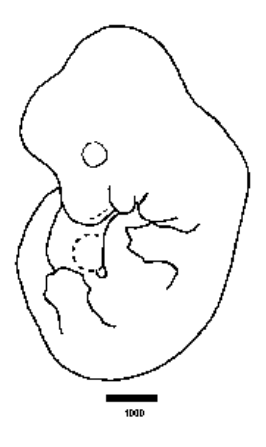
Figure 2: Schematic of a Theiler Stage 20 embryo

In order to increase the recall of user searches for anatomical structures, we have undertaken to increase the number and range of synonyms for elements of the nomenclature, by semi-automatically