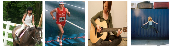
riding horse running playing guitar jumping

Action recognition is the task of identifying the action being depicted in a video or still image. The task is useful for a range of applications such as generating descriptions, image/video retrieval, surveillance, and human–computer interaction. It has been widely studied in computer vision, often on videos (Nagel, 1994; Forsyth et al., 2005), where motion and temporal information provide cues for recognizing actions (Taylor et al., 2010). However, many actions are recognizable from still images, see the examples in Figure 1. Due to the absence of motion cues and temporal features (Iki-izler et al., 2008) action recognition from stills is more challenging. Most of the existing work can be categorized into four tasks: (a) action classification (AC); (b) determining human–object interaction (HOI); (c) visual verb sense disambiguation (VSD); and (d) visual semantic role labeling (VSRL). In Figure 2 we illustrate each of these