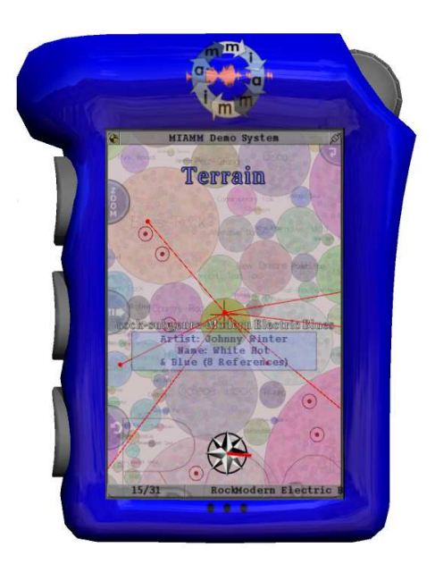
Figure 1: The PDA simulator with the terrain visualization of the database

The envisioned end-user device is a handheld Personal Digital Assistant (PDA, see figure 1) that provides an interface to a music database. The device includes a screen where data and system messages are visualized, three force-feedback buttons on the left side and one combined scroll wheel/button on the upper right side, that can be used to navigate on the visualized data, as well as to perform actions on the data items (e.g. play or select a song), a microphone to capture spoken input, and speakers to give audio output. Since we do not develop the hardware, we simulate the PDA using a 3D model on a computer screen, and the buttons