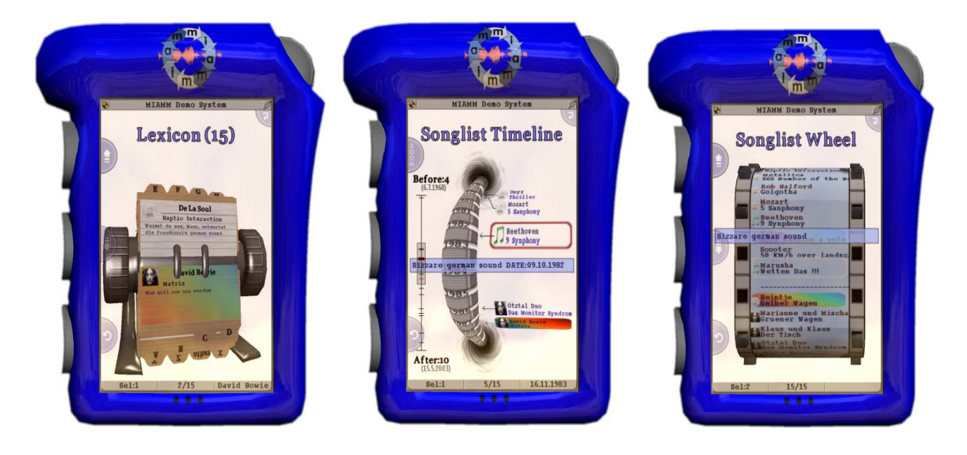
Figure 2: Visualizations

line visualization shows the items in chronological order, on a "rubber" band that can be stretched to get a more detailed view. The wheel metaphor presents the items as a list on a conveyor belt, which can be easily and quickly rotated. Finally, the terrain metaphor (see figure 1) visualizes the entire database. The rendering is based on a three layer type hierarchy, with genre, sub-genre and title layers. Each node of the hierarchy is represented as a circle containing its daughter nodes. Similarities between the items are computed from the genre and mood information in the database and mapped to interaction forces in a physical model that groups similar items together on the terrain. Since usually albums are assigned more than one genre, they can be contained in different circles and therefore be redundantly represented on the terrain. This redundancy is made clear by lines connecting the different instances of the same item.