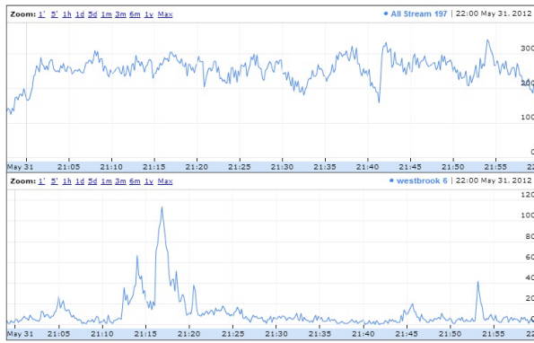
Figure 1: Example Twitter event stream (upper) and participant stream (lower). Event stream contains tweets related to an NBA basketball game (Spurs vs Thunder) scheduled on May 31, 2012; participant stream contains tweets corresponding to the player Russell Westbrook in team Thunder. X-axis denotes the timeline and y-axis represents the number of tweets per 10-second interval.

ing key information must be reflected in the event summary. As such, event summarization research has been focusing on developing accurate sub-event detection systems and generating text descriptions that can best summarize the sub-events in a progressive manner (Chakrabarti and Punera, 2011; Nichols et al., 2012; Zubiaga et al., 2012).