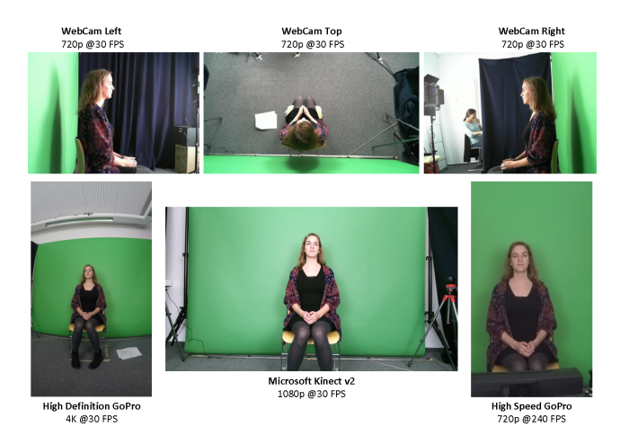
Figure 1: Sample recording output from the video cameras.