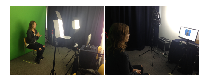
Figure 2: Recording setting.