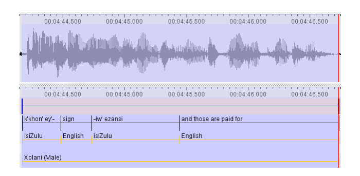
Figure 1: A screenshot of ELAN media annotation tool. Only four annotation tiers are shown due to limited space.