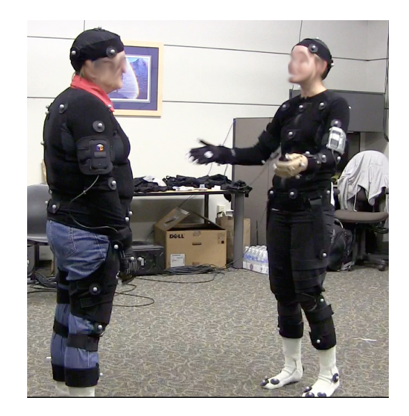
Figure 1A: Extravert-Extravert pair demonstrating a broad gesture.

implemented in an interactive agent (Neff, Wang, Abbott and Walker, 2010). Measurements were taken for the first and third activity of the session in order to capture change over the course of the interaction.