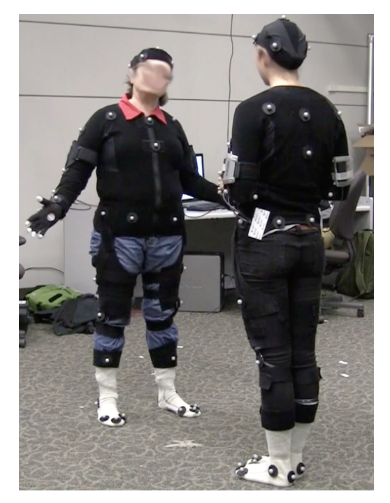
Figure 1B: Extravert-Extravert pair demonstrating a broad gesture.

Figure 1A: Extravert-Extravert pair demonstrating a broad gesture.