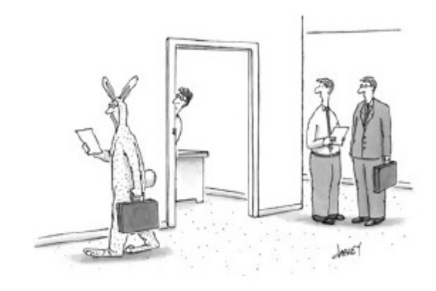
Figure 2: Cartoon number 32