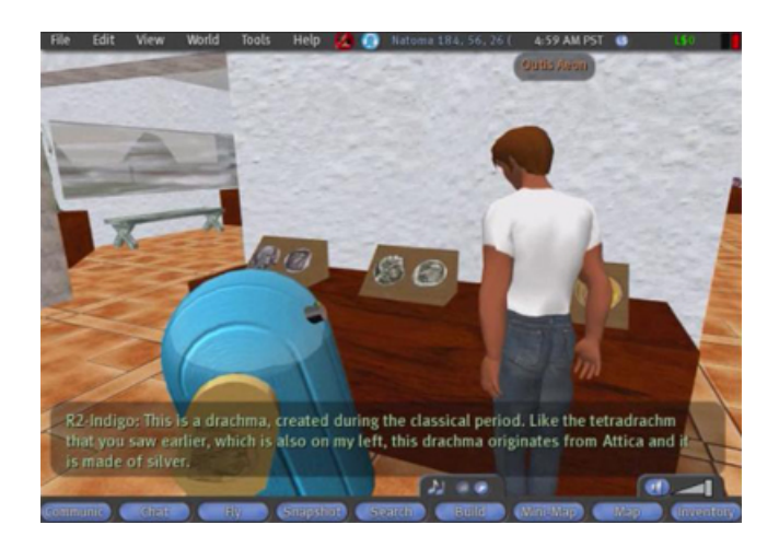
Figure 1: Generating texts in Second Life.

NaturalOWL is based on ideas from ILEX (O'Donnell et al., 2001) and M-PIRO (Isard et al., 2003; Androutsopoulos et al., 2007), but it uses