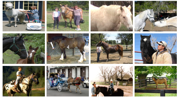
(b) Top: ‘White’+‘Horse’ (Gaussian), Middle: ‘Black’+‘Horse’ (Gaussian), Bottom: ‘Black’+‘Horse’ (Vector)