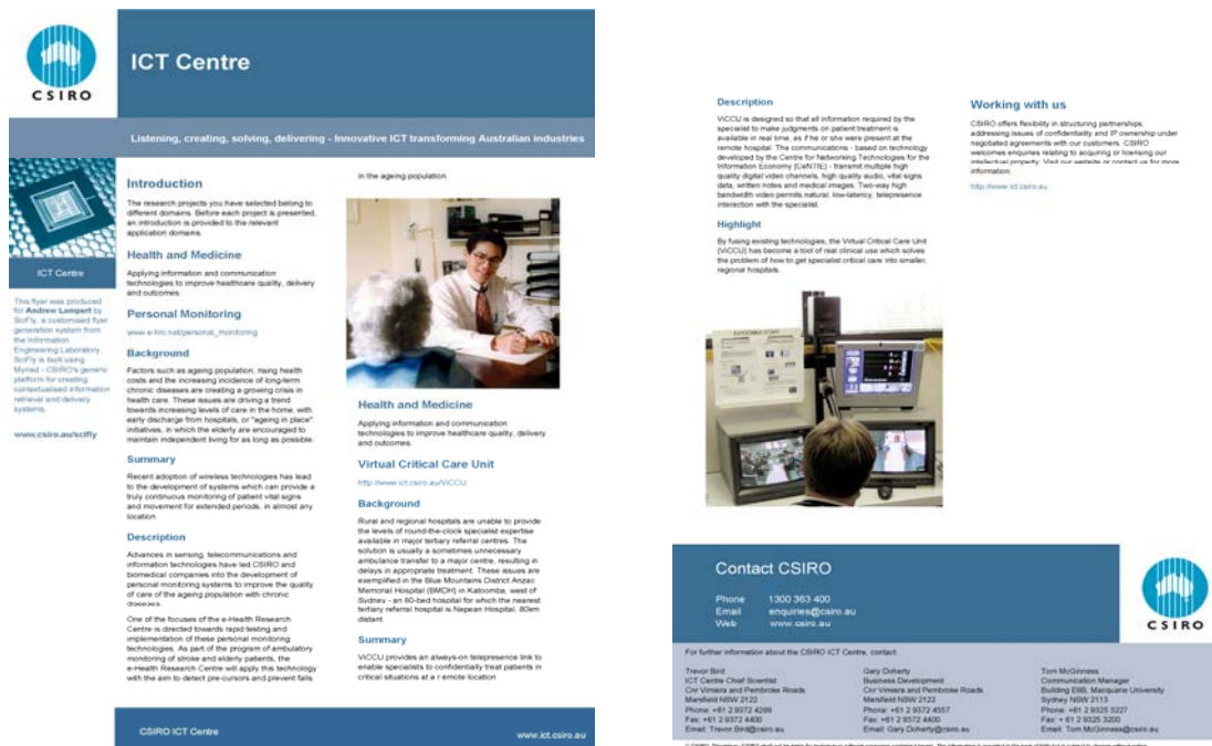
Figure 1. A brochure generated by our system

potentially only slightly shortening a text. Our task brings new challenges, e.g., filling the space optimally and producing a balanced text.