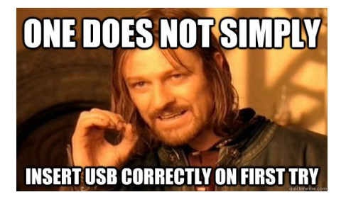
Figure 1: Snowclone example, based on "One does not simply walk into Mordor" from "Lord of the Rings".

Detection and tracking of digital memes have been the focus of multiple computational studies. The closest to our work are MEMETRACKER and NIFTY (Leskovec et al., 2009; Suen et al., 2013), that tracked quotations attributed to individuals. These works focused on short, distinctive phrases that travel relatively intact through on-line text. Other related tasks are multi-word expression/idiom identification (Haagsma et al., 2020; Zarrieß and Kuhn, 2009; Muzny and Zettlemoyer, 2013) and cliché detection (Cook and Hirst, 2013; van Cranenburgh, 2018). Again, idioms and multiword expressions are chiefly fixed expressions ("cat got your tongue?", "jumped the shark") that rarely change their meaning across mutations. Therefore,