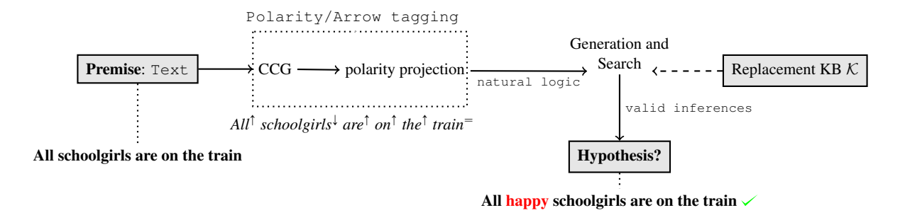
Figure 1: An illustration of our general monotonicity reasoning pipeline using an example premise and hypothesis pair: All schoolgirls are on the train and All happy schoolgirls are on the train .

of which require full semantic parsing and more complex logical machinery). We also introduce a supplementary version of SICK that corrects several common annotation mistakes (e.g., asymmetrical inference annotations) based on previous work by Kalouli et al. (2017, 2018)<sup>1</sup>. Positive results on both these datasets show the ability of lightweight monotonicity models to handle many of the inferences found in current NLI datasets, hence putting a more reliable lower-bound on what results the simplest logical approach is capable of achieving on this benchmark.