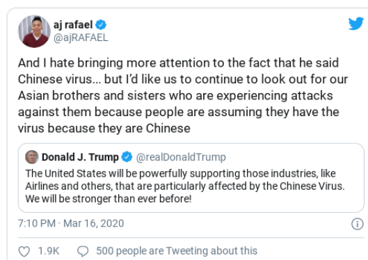
Figure 1: The tweets above displays an example of hate speech used for scapegoating by @realDonaldTrump and the response of @ajRAFAEL highlighting the impact this hate speech has on Asian Americans.

The importance of identifying hate speech combined with the magnitude of the data makes this an area in which innovations achieved in NLP and AI research can make an impact. However, the datasets we use reflect their environments and even their annotators (Waseem, 2016) (Sap et al., 2019), there are inherent cues contained by the data which can bias the predictions of models developed from these data (Davidson et al., 2019). In the context of detecting hate speech detection, this can lead to predictions be largely the outcome of a few key terms (Davidson et al., 2017). Being able to explain how underlying data impacts AI decision outcomes has real world applications, and social media companies ignorant to this fact could face a multitude of ethical and legal repercussions (Samek et al., 2017).