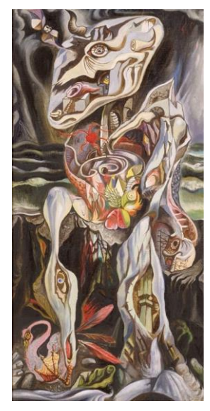
Figure 2: André Masson, Labyrinth, 1938.

Additionally, in order to collect ontology requirements, an online survey will be distributed among specialists in Outsider Art at different institutions across the world, e.g. Museu d'Art Brut<sup>1</sup> (Barcelona), Collection de l'Art Brut<sup>2</sup> (Switzerland), Outsider Art Fair<sup>3</sup> (Paris), Raw Vision Magazine<sup>4</sup>, etc.