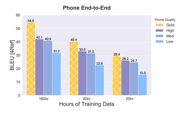
Figure 4: Phone End-to-End Robustness : trainable embeddings for phone labels are concatenated to frame-level filterbank features. Comparing performance across three data conditions and phone label qualities.

This model's input contains both the phone features used in the phone cascade and speech features of the baseline end-to-end model, but unlike the phone cas-