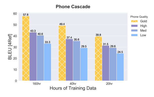
Figure 3: Phone Cascade Robustness : using phone labels in place of BPE as the text source for downstream MT. Comparing performance across our three data conditions and phone label qualities.

Phone cascades use a representation for translation which may be more robust to non-phonetic aspects of orthography. However, as a cascaded model, this still requires hard decisions between ASR and MT, and so we may expect lower phone quality to lead to unrecoverable errors. Figure 3 compares the impact of phone quality on the performance of phone cascades trained on our high, medium, and low-resource conditions. We use alignments produced with gold transcripts as an upper bound on performance. We note that with gold alignments, translation performance is similar to text-based translation (see Section 6). We see that phone quality does have a significant impact on performance, with the MT model trained on low phone quality yielding similar translation performance using the full 160 hour dataset to the MT model with the highest quality phones trained on only 20 hours. However, we also see significantly more data-efficiency with this model, with less reduction in performance between 160hr \rightarrow 40hr \rightarrow 20hr training conditions than previous models.