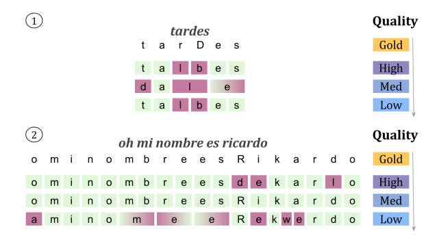
Figure 5: Two examples of phone sequences demonstrating differences across qualities of phone features. (See Table 1 for the mapping between quality and generation procedure). Note: word-level segmentation is not marked, as it is also not present in {speech,phone} source sequences for translation.

Relating our observed trends to the differences between our phone cascades and phone end-to-end models, we note that differences in frame-level phone boundaries would not affect our phone cascaded models, where the speech features are discarded, while they would affect our phone end-to-end models, where the phone labels are concatenated to speech feature vectors and associate them across the corpus. While errors in phone labels may be seen as 'unrecoverable' in a cascade, for the end-to-end model, they add noise to distribution of filterbank feature associated with each phone label embedding, which appears to have a more negative impact on performance than the hard decisions in cascades. Though the concatenated filterbank features may allow our end-to-end models to recover from discrete label errors, our results testing various phone qualities suggest this may only be the case under higher-resource settings with sufficient examples.