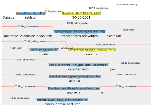
Figure 2: Annotation of an excerpt from a medical report using the latest version of the annotation scheme. Events are marked in blue and temporal expressions in yellow. The annotated excerpt illustrates the identification of various attributes associated with both events and temporal expressions, as well as the temporal relations between events and between events and temporal expressions. "Registration date: 06/30/2021. The patient is a 35-year-old with no relevant medical history, presenting with recent symptoms of asthenia, anorexia, and night sweats".