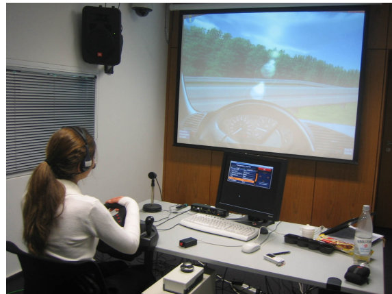
Figure 1: Experiment setup

Setup Figure 1 shows a picture of the experiment setup. To simulate the driving situation, we used the “3D-Fahrschule” software. 2 The driving simulator visuals were projected on a wall-sized back-projection screen. The graphical interface of the SAMMIE system was shown on a display next to the steering wheel. Participants wore headphones with a microphone for the spoken input and output. The button for manual input was positioned to the right of their chair. The experimenter was sitting in an adjacent room and could see and hear everything happening in the experiment lab. The subjects could not