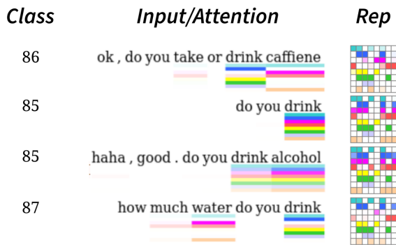
Figure 2: Example inputs with bottleneck attention head representations. The colored underlines show the foci of the attention heads, with opacity reflecting attention weights. The activation patterns in the correspondingly-colored rows of the grid representations reflect how the attended tokens are represented by each head. Note that heads consistently attending to “drink” (e.g. yellow and green) have similar representations across classes, while heads attending to the object of drinking (e.g. magenta and tan) have distinct representations for each class; further, the object-focused heads accept the verb as a stand-in for its implicit object when alcohol is not explicitly mentioned.

and on , which are similarly predictive of questions about prescribed medication (e.g. “Are you on any prescriptions?”), but which word senses are unlikely to converge representationally from pretraining on a general domain corpus. We take this as evidence of the BiGRU’s ability to disambiguate word senses based on context, especially since we occasionally observe the same word types in different clusters within the same head. Finally, we observe some very broad concepts being captured by some attention heads that generalize across many classes, such as the notion of temporal existential quantifiers ( ever , before , experienced ).