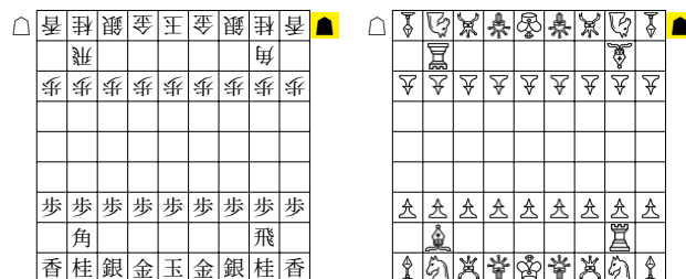
Figure 1: Initial state of shogi . Left: normal (Japanese Kanji style) depiction. Right: chess-like depiction.

In this paper, we propose “Event Appearance” label. Event appearance shows the relationship between events that are mentioned in texts and events that happen in the real world. Event appearance consists of temporal relation, appearance probability, and evidence of event. For annotation, we called annotators with high skill of shogi . In addition, we evaluated the