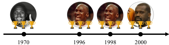
Figure 3: Player awards are presented in a timeline.

Text: Shaquille O'Neal is one of only three players to win NBA MVP, All-Star