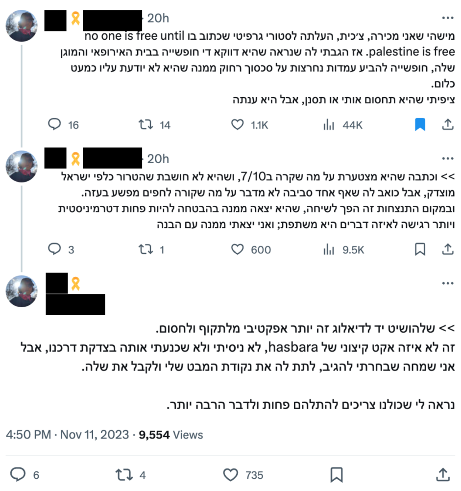
Figure 3: Original Hebrew account of productive sidcourse

The original account of the productive discourse is provided in Figure 3. The English translation is presented in the Ethics and Broader Impact section.