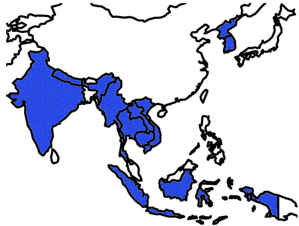
Figure 1: National languages covered: Hindi, Nepali, Burmese, Thai, Lao, Khmer, Vietnamese, Indonesian, Korean. We build parallel corpora for these languages paired with English.

We introduce neural methods and a toxicity filtering step to the hierarchical web mining approach of Paracrawl (Bañón et al., 2020), showing large improvements. We apply these methods to web-scale parallel corpus mining for 9 South and East Asian national languages, creating training resources for machine translation that yield better translation quality for most of these languages than existing publicly available datasets in OPUS. Our methods also generally lead to better results than the global mining approach of Schwenk et al. (2021).