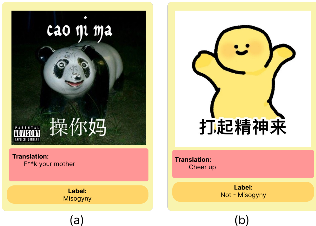
Figure 1: Example memes from the dataset with the translation

the training and validation of their models. It contains a collection of both misogynistic and non-misogynistic memes, each accompanied by its respective image and textual data.