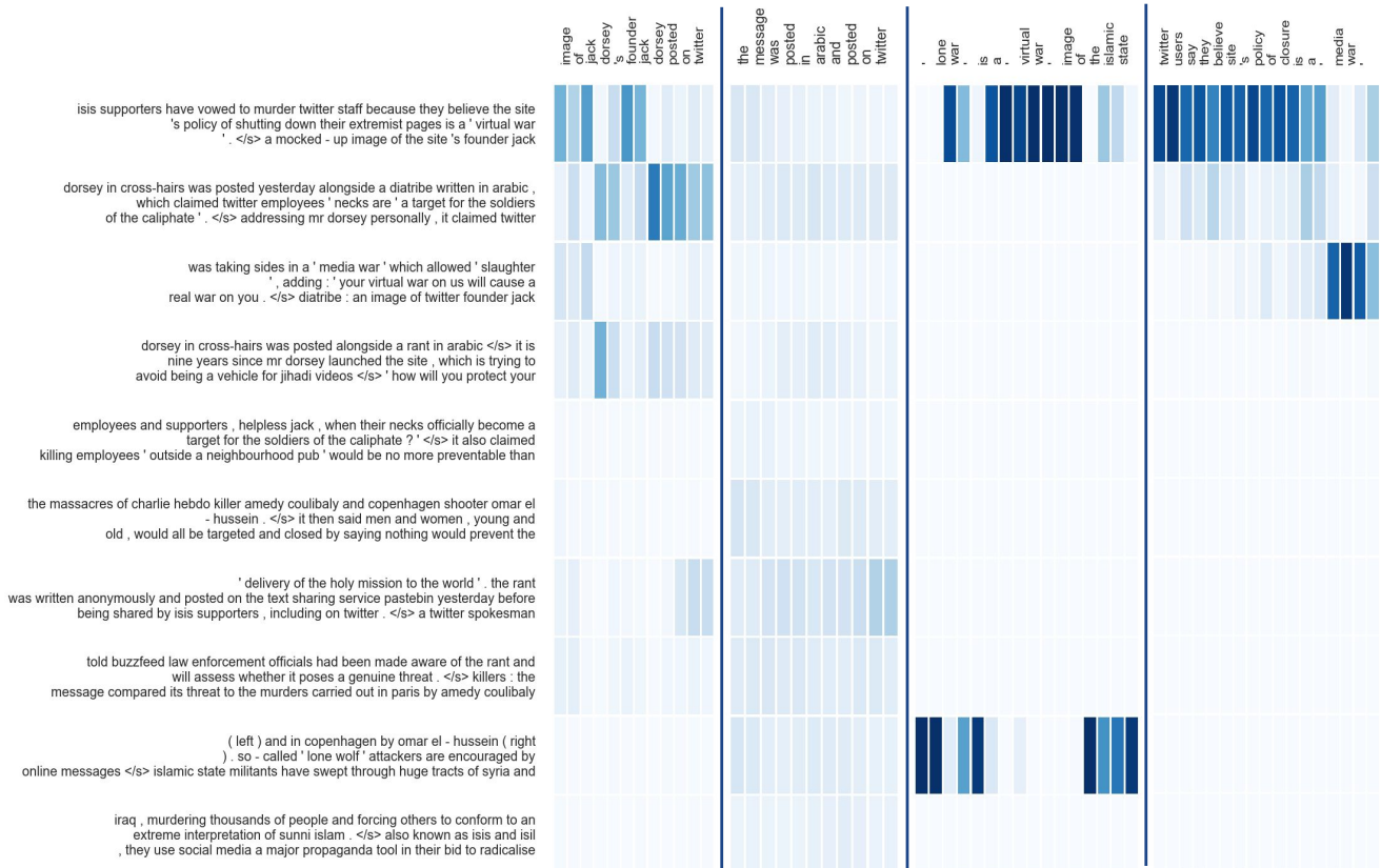
Figure 3: Sentence attention visualizations for different models. From left to right: (1) STANDARD, (2) HIER, (3) C2F, (4) C2F +MULTI2 +POS.

encoding model due to the training process.