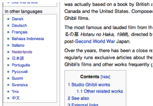
Figure 2: Links to pages devoted to the same topic in other languages.

concepts or entities that have entries in Wikipedia, and we will represent sentences by entries from this lexicon: an entry is used to represent the content of a sentence if the sentence contains a hypertext link to the Wikipedia page for that entry. Sentence similarity is then captured in terms of the shared lexicon entries they share. In other words, the similarity measure that we use in this approach is based on “concept” or “page title” overlap. Intuitively, this approach has the advantage of producing a brief but highly accurate representation of sentences, more accurate, we assume than the MT approach as the titles carry important semantic information; it will also be more accurate than the MT approach because the translations of the titles are done manually.