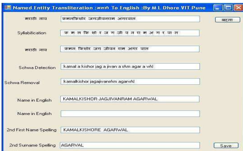
Figure 2. Transliteration Using Phonology and Stress Analysis

We have developed real time application for a co-operative banking which allows user to enter data in Marathi or Hindi language and transliterate it into English. Figure 2 shows the snapshot from our experimentation for full name transliteration in English.