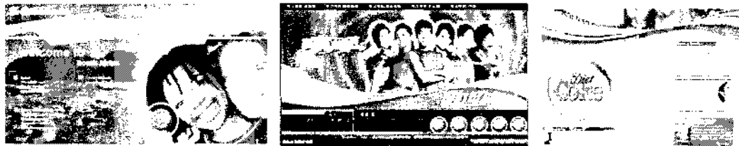
Three Coca-Cola web sites: South Africa, China and India (from left to right). Designers of global web sites try to reflect the cultural preferences of their local target audience.

Travel writer Macon Leary needed Muriel, a deliciously peculiar dog-obedience trainer, to end his insular world and thrust him headlong into a remarkable engagement with life. Local content producers and local cultures need the technical experts to bring their content to the world so that the world can enjoy the different perspectives and approaches offered by them. What is needed is more local content and better access to this content - not more localisation of content originating from one single culture.