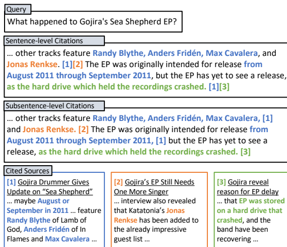
Figure 1: Example of subsentence-level citations. Compared to sentence-level citations, the finer granularity of subsentence-level citations more precisely connect the generated content with the supporting source documents.

to support their statements (Bohnet et al., 2023; Gao et al., 2023). Verifiable generation enables users to trace the information back to its source and verify its correctness, enhancing the transparency and reliability of models. Nonetheless, existing work typically provides sentence-level citations. They are unable to indicate which part of the sentence is supported by each referenced source document, leaving the effort to users to infer the connection between the content and its citation (Liu et al., 2023a; Schuster et al., 2023). This ambiguity hinders the user's ability to verify the information efficiently and understand the scope of the supporting documents.